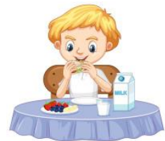
Eat a sandwich before I wash my hands