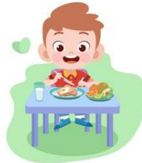
Eat healthy food