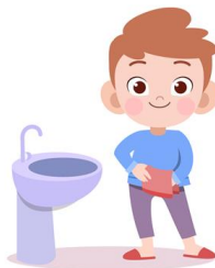
Use a clean towel to dry my hands