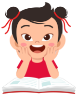
Touch my face