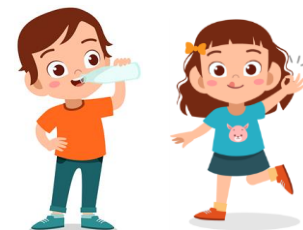
Share my drink with a friend