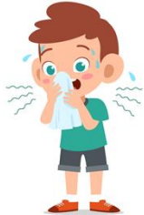
Cough/sneeze into my elbow or tissue

Circle the good habits. Cross out the bad habits.