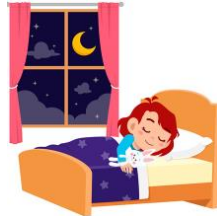
Get lots of sleep