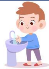
Wash my hands