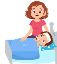
Stay home when I am sick